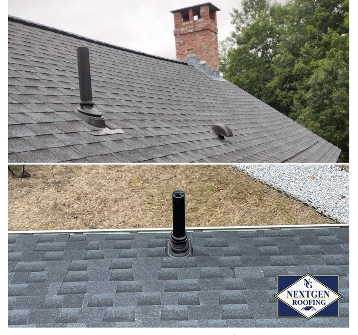
Nextgen Roofing installations of The Ultimate Pipe Flashing® and The Ultimate Bath/Dryer vent.