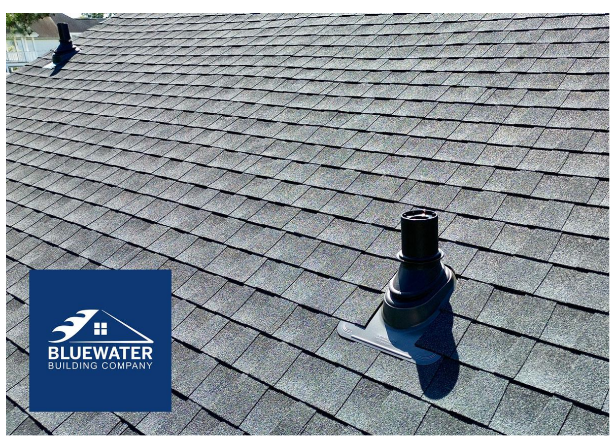
Bluewater Building Company installations of The Ultimate Pipe Flashing® with EASYSleeve®

Don't forget to stay connected with us on Instagram and Facebook for captivating before and after shots, insightful home tips, behind-the-scenes glimpses of ongoing projects, and much more! Follow us @bluewaterbuildingcompany and be a part of our thriving community."