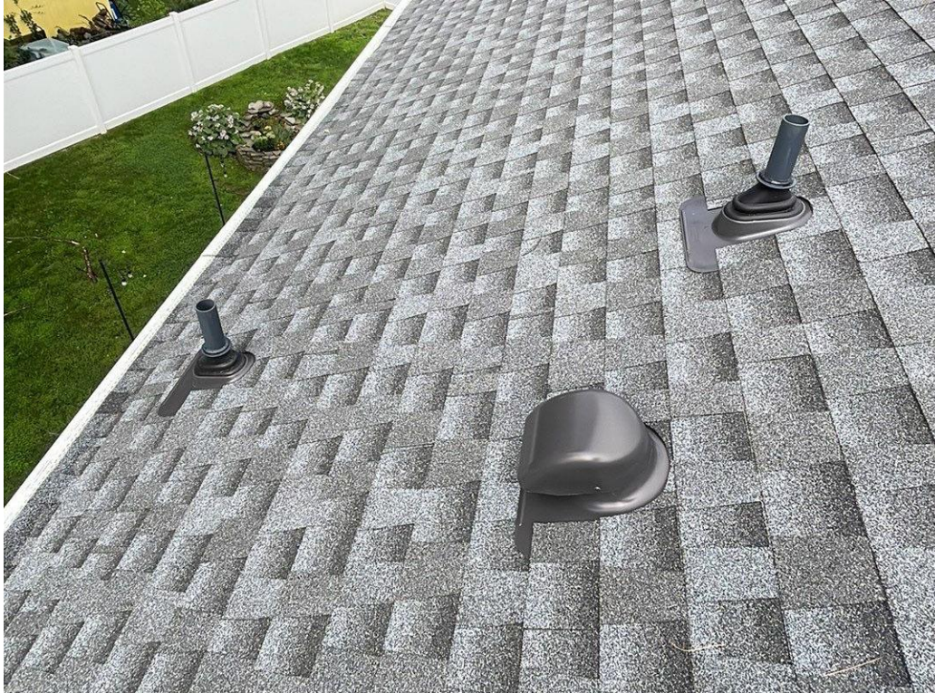
Roofing & More, Inc. installations of the Ultimate Pipe Flashing® and the Ultimate Bath/Dryer Vent