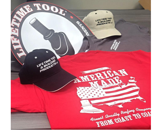
photo with one of our components, and we may share your photo on our social media accounts or feature you in an upcoming newsletter. If we use your photo, we will mention your company, and you may also receive a FREE Lifetime Tool® T-Shirt or Hat!