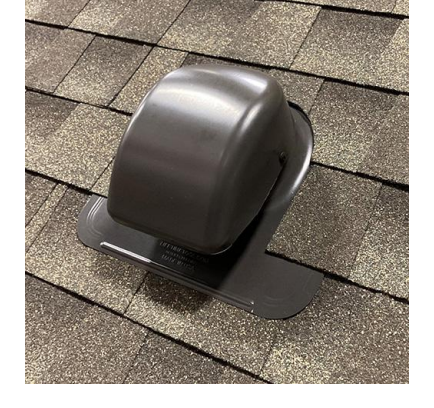
THE ULTIMATE BATH/DRYER VENT US PATENTS D934,409 S 10,927,550 B1

Its rubber damper cushions provide for a quieter operation, and its patented design easily passed the 110 MPH Wind Driven Rain Test. Built to truly last the life of the roof, and 100% made in the USA.