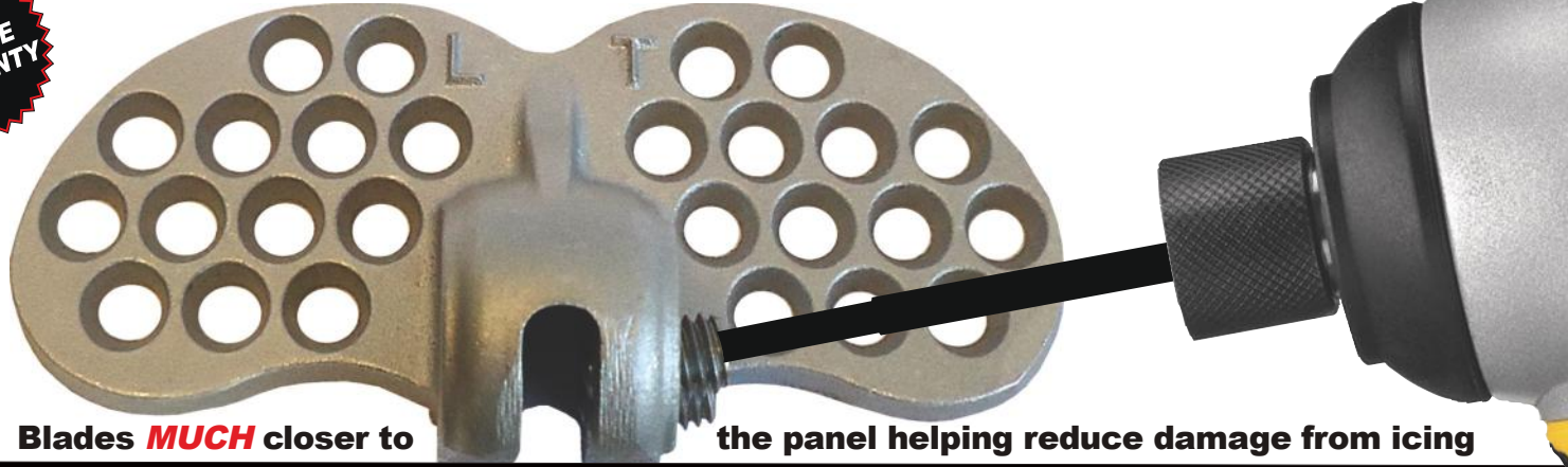
Blades MUCH closer to the panel helping reduce damage from icing

LIFETIME'S PATENTED ANGLED SET SCREWS HELP PREVENT PANEL DAMAGE